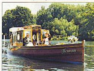
Fleurette pulled the votes

calm and moonlit — saw a spectacular pageant of illuminated boats, a sparkling and dazzling affair, from candlelit punts to launches with generators powering fairy lights.