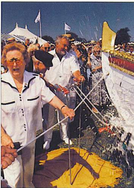
Christened in bubbly: Royal Thamesis .

calm and moonlit — saw a spectacular pageant of illuminated boats, a sparkling and dazzling affair, from candlelit punts to launches with generators powering fairy lights.