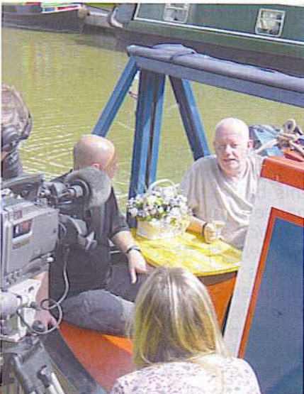
Being filmed for TV's Water World .