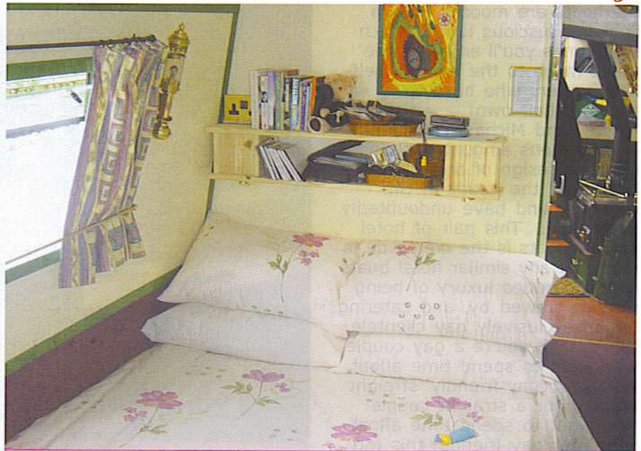
A typical twin cabin aboard the butty Alnwick .

designed to begin and end within easy reach of a railway station, and a member of the crew meets and greets you at the station. We started our cruise in Rugby, and from the very outset were treated as though we were the only people in the world that mattered to the crew.