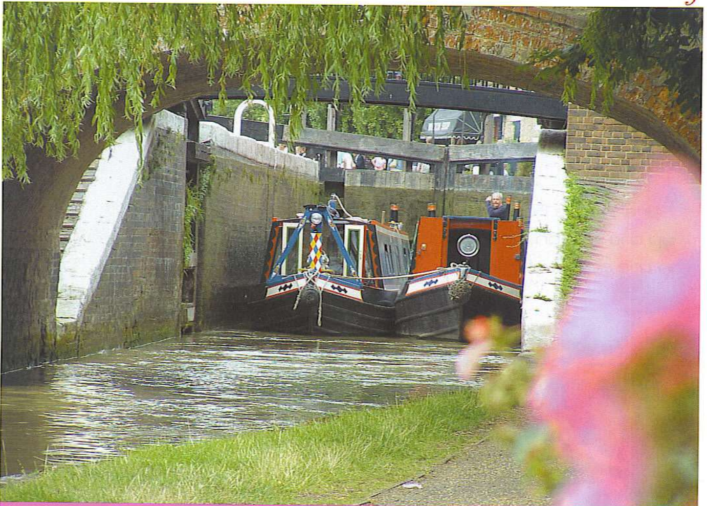
Morpeth and Alnwick emerge from a lock on the Grand Union - guests can help work locks should they so desire.