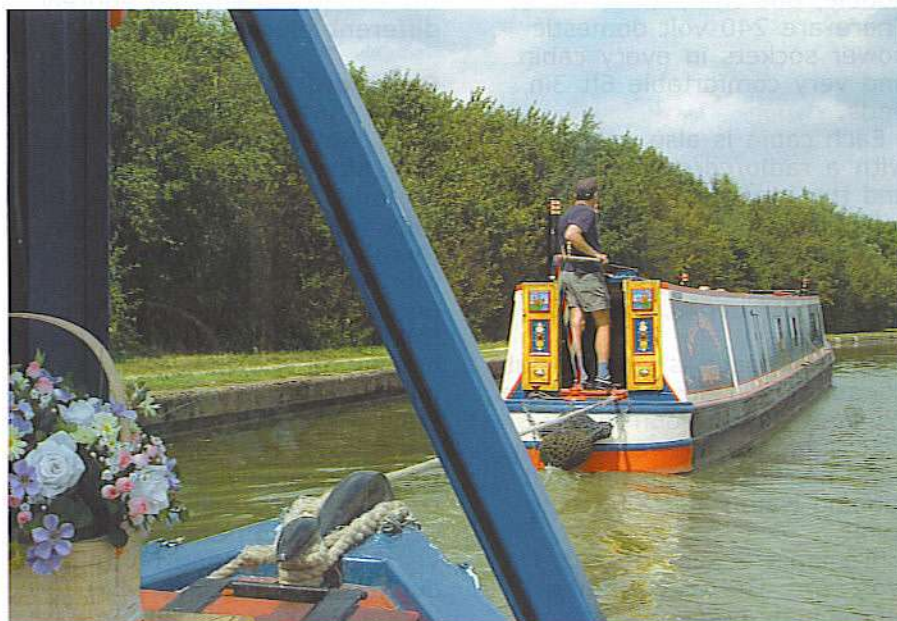
Morpeth tows Alnwick on a long line.